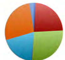
2017 FBISD Ethnicity